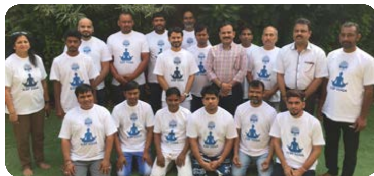
The Indian Community Relief Fund ("ICRF") organised its 4th YOGA camp at the AAA Homes compound, Budaiya