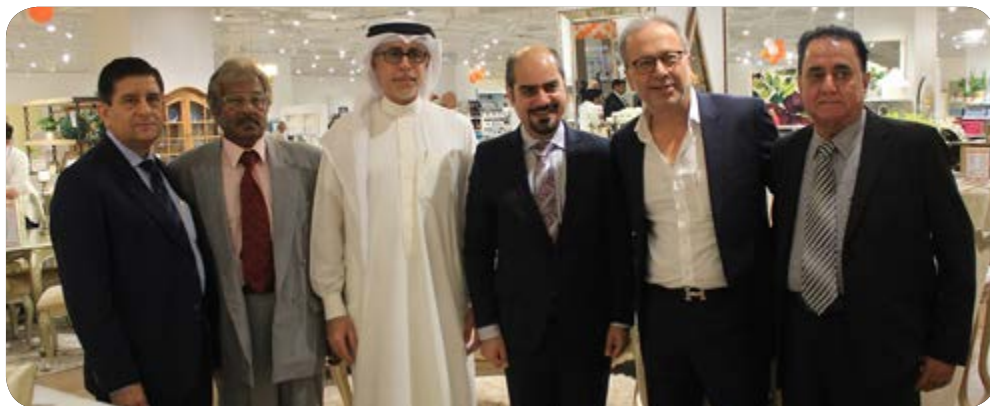
The Home Store Launches Second showroom in Bahrain at City Centre Bahrain