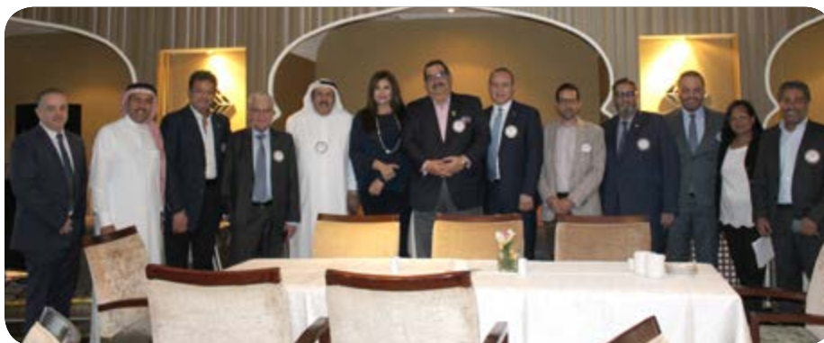
Rotary Club of Sulmaniya held a regular lunch meeting at the Golden Tulip Hotel.