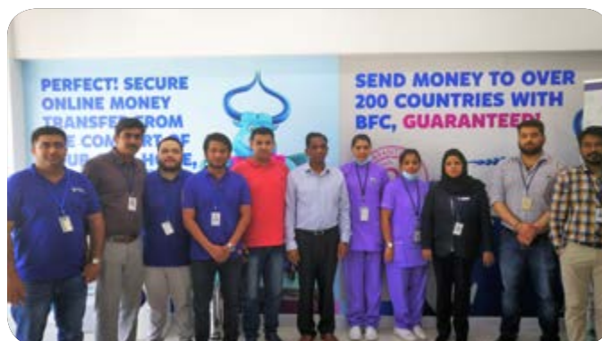
BFC conducted a free health checkup camp for the people who stays in the vicinity of its Budaiya Village Branch. The camp was conducted in association with Al Hilal Medical Centre