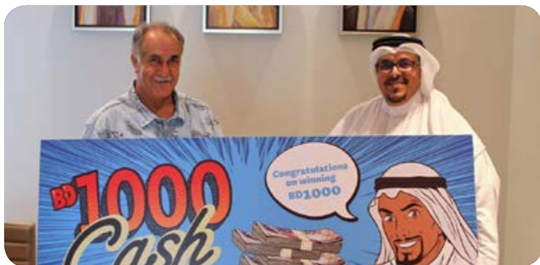
Seef Mall Announces the July Winners of its 'Shop Daily Win Weekly BD1,000 Cash'