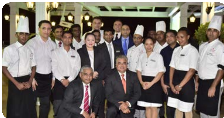
Ramada Hotel & Suites Amwaj Islands organized Media dinner at newly opened restaurant and lounge, Ya Hala