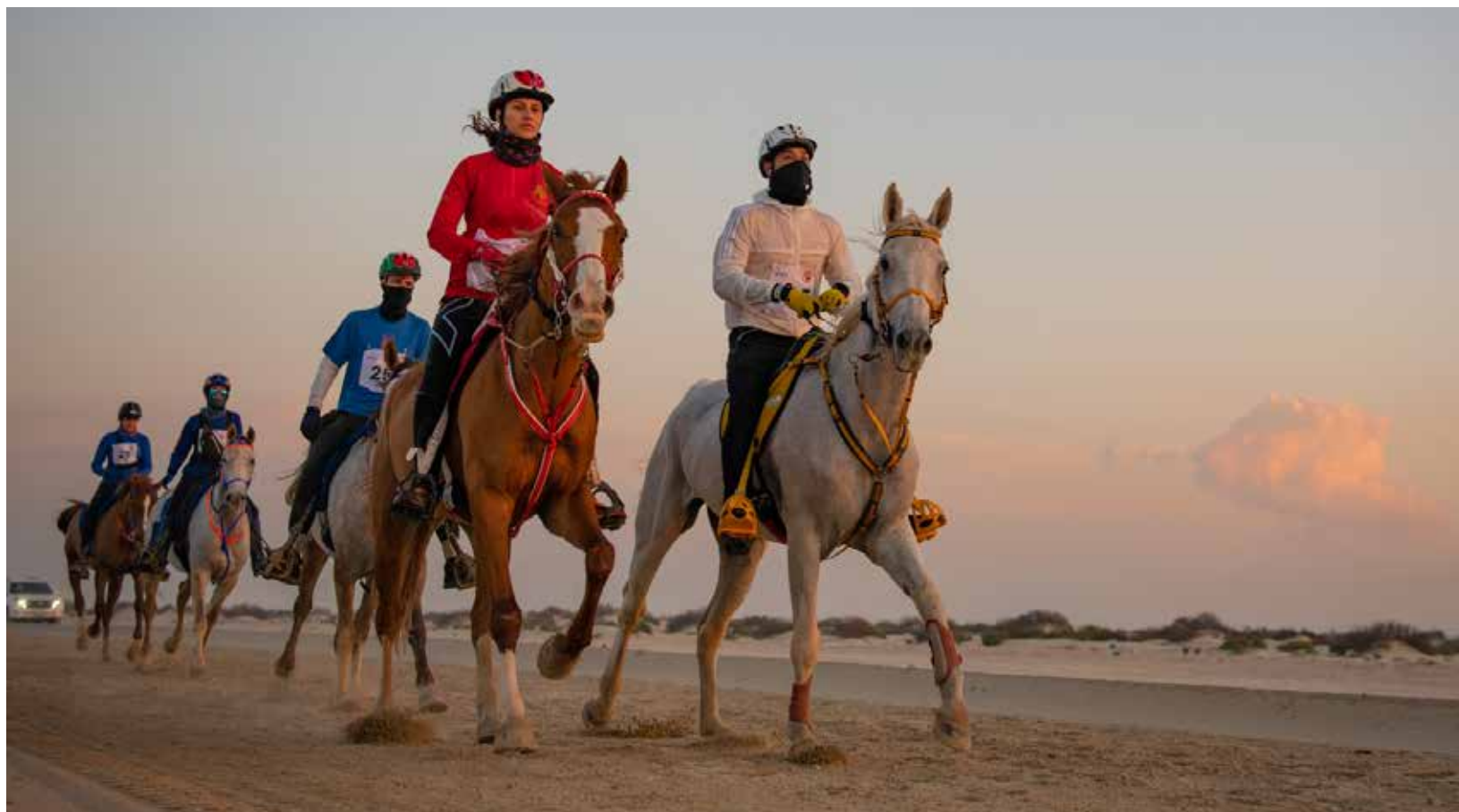
HH SHAIKH KHALID BIN HAMAD AL-KHALIFA ENDURANCE CHAMPIONSHIP - HUGE SUCCESS!