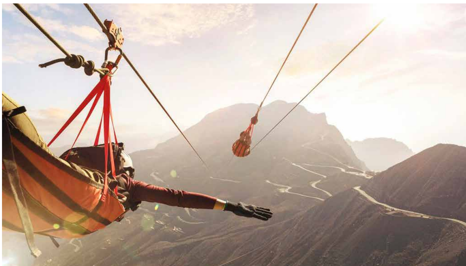
RAK EXPECTS MORE VISITORS AFTER BEING NAMED GULF TOURISM CAPITAL