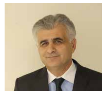
By: Dr Jassim Haji

It isn't after your data. It doesn't want to serve you ads. It isn't trying to lock you into an ecosystem. If you want to use your computer with peace of mind, free and open-source software is the way to go.